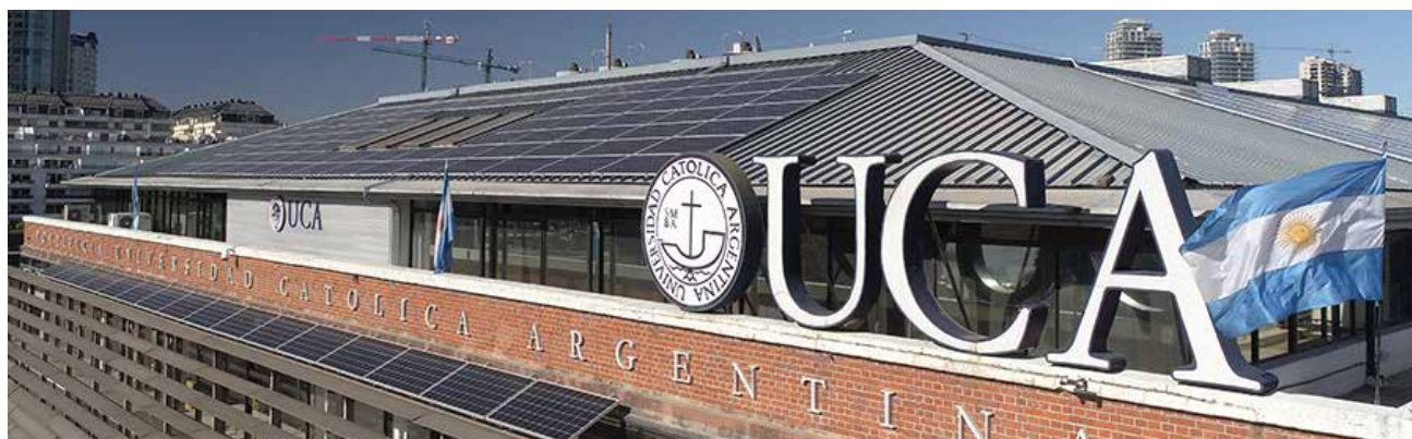
The Pontifical Catholic University of Argentina